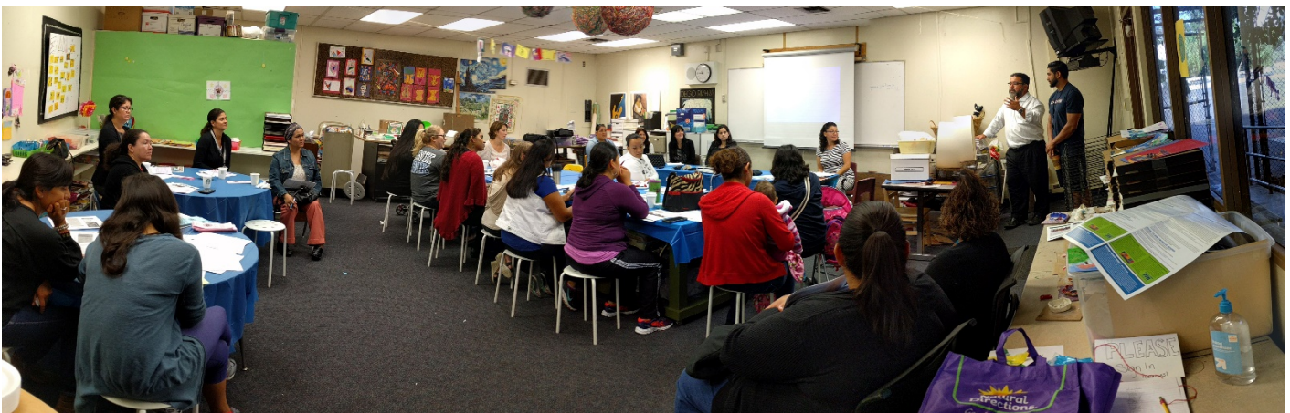
First ELAC meeting of the 2016-2017 school year.

What has been your experience at San Rafael? Why did you choose this school? Coming from a mixed origin, I know very well what it means to be different from others. So, when I was in the process of choosing the school for my children I was looking for a place where the difference in culture was appreciated. At the same time, in our house we only speak Spanish, then also it was important to find a program that could help my children with the transition from one language to another. When I did the research about San Rafael, I knew that this school could give the balance that i was looking for them. We have been very fortunate to be part of a very proud and united community. Above all, the experience we have had in San Rafael has been exceptional. The teachers are very professional and affectionate with children. The other families accept the differences of cultures and languages and are also excited to learn more.