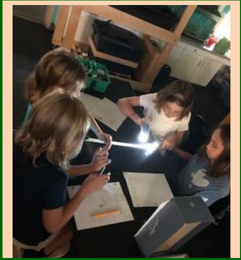
Science Lab explorations and a visit from Chuck E. Cheese!